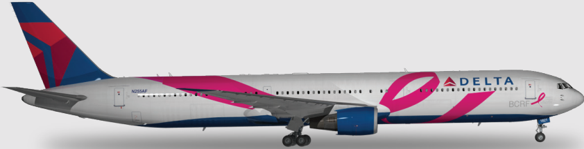
201 FT 4 IN (61.37 M)

Every year, Delta’s pink plane—“Breast Cancer One”—makes a special flight to kick off the airline’s breast cancer awareness and fundraising campaign for the Breast Cancer Research Foundation. Around 140 breast cancer survivors—employees and customers—go on an overnight trip (this year’s flight headed to L.A.). During the rest of the year, the plane is put back into service—primarily around the U.S., South America and Europe—spreading breast cancer awareness across the globe.