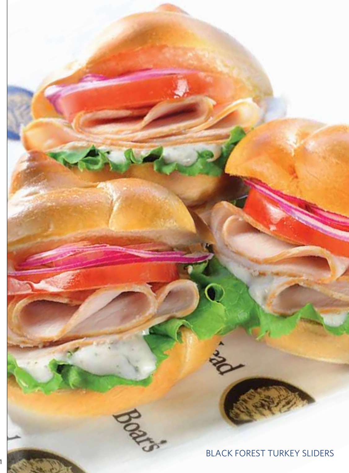
BLACK FOREST TURKEY SLIDERS